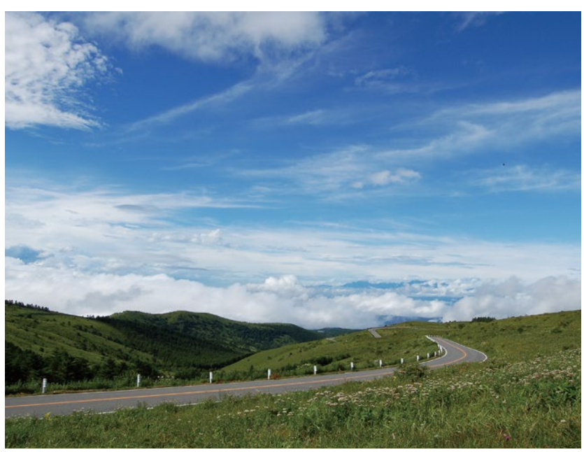
Winding through the highlands of Tateshina and Kurumayama, the Venus Line is a sightseeing route with stunning views, beautiful backdrops, and plenty of places to stop and experience the natural wonders on offer.