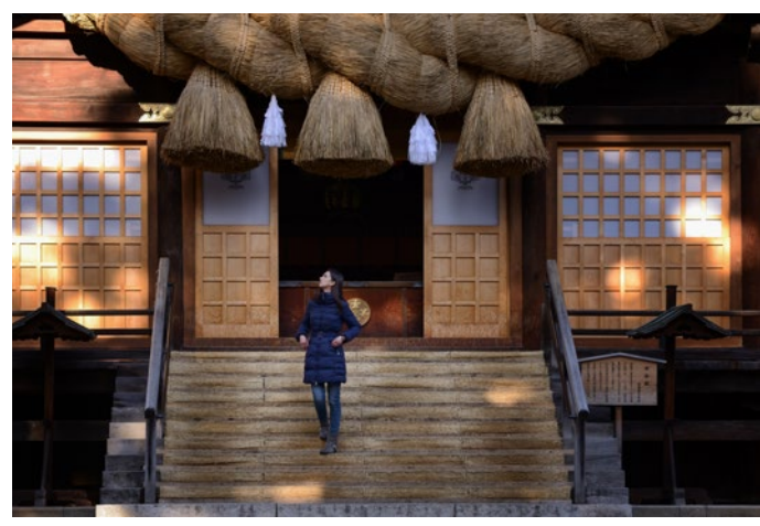
1. Suwa Taisha, near the banks of Lake Suwa, is one of the oldest shrines in Japan. The shrine areas are surrounded by thick trees and a serene atmosphere. Shimosha is accessible both on foot and by bicycle.

There is so much to do in Suwa, and you can easily fill a day trip – or more – exploring the area. We offer a few area highlights with a focus on Japanese history and culture as a sample one-day itinerary. This trip can be easily made on foot or with a rental bicycle, and starting locations are near Shimo-Suwa Station.