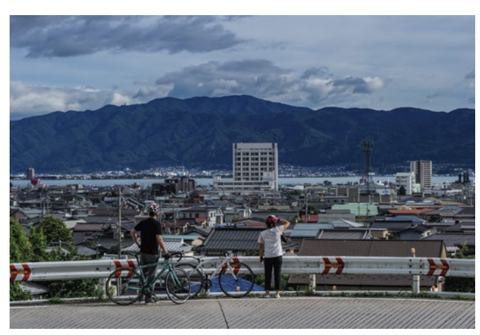
2. Suwa is well suited for exploration on two wheels. Its rich nature and moderate temperatures make an ideal environment for riders to enjoy the fresh air while cycling, and locales are sufficiently close to be convenient.