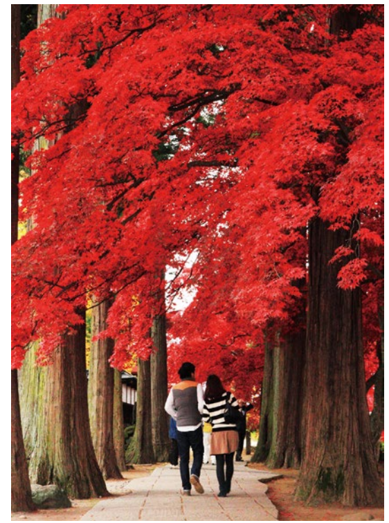
This pretty temple, established in 1649, comes ablaze with brilliant color in autumn. The 300-year-old path leading up to Choenji is lined with cedar trees that turn red in fall, and the colors are reflected in the temple's pond.