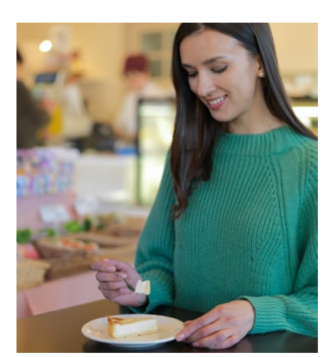
5. Whistle wetted, the next stop is Maruyasu-Tanakaya for a popular local treat – cheesecake made from Yatsugatake milk and the area's natural cheese, for a creamy sweet baked dessert made on the premises.