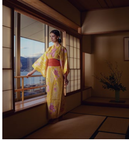
7. After a day of activity, it's time to unwind at your ryokan, where good food, Japanese hospitality, and soothing hot spring baths await.