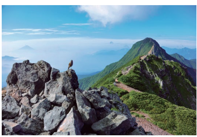
Suwa is nestled in the heart of mountainous Nagano, one of the most famous mountain regions in the country. The volcanic mountain range of Yatsugatake is good for alpine hiking, crisp air, and sweeping views.