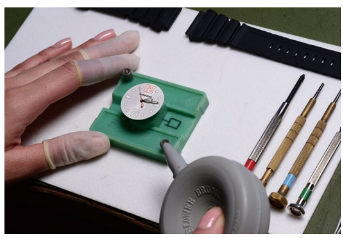
3. Stop off at the Gishodo Watch and Clock Museum, where you can take a workshop, led by a certified technician, to make a watch or clock as a souvenir.