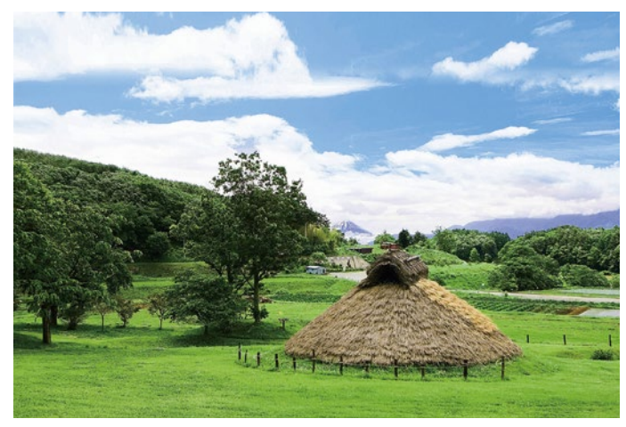
Suwa is said to have prospered during the Jomon Period, which dates from around 14,000 BCE. Many significant archeological finds have been unearthed in the area, and the unspoiled nature allows you to imagine what might have been present centuries ago.