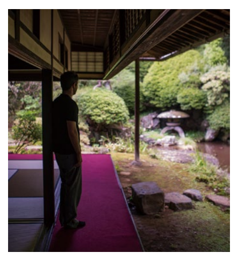
6. At the Honjin Iwanamike (Old Samurai House), see a beautifully preserved traditional Japanese residence and VIP accommodation complete with a classic garden. It's a perfect place for a few minutes' rest.