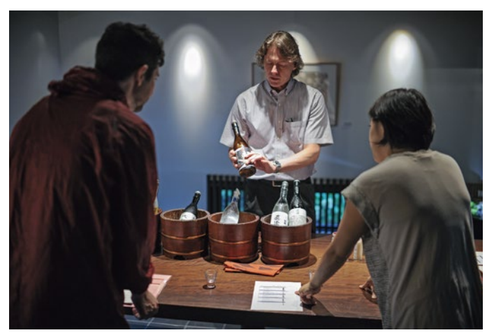
4. Walk along the lake for ten minutes toward Kami-Suwa Station, where five local sake breweries – Masumi, Maihime, Reijin, Honkin, and Yokobue – await. All offer sake tasting.