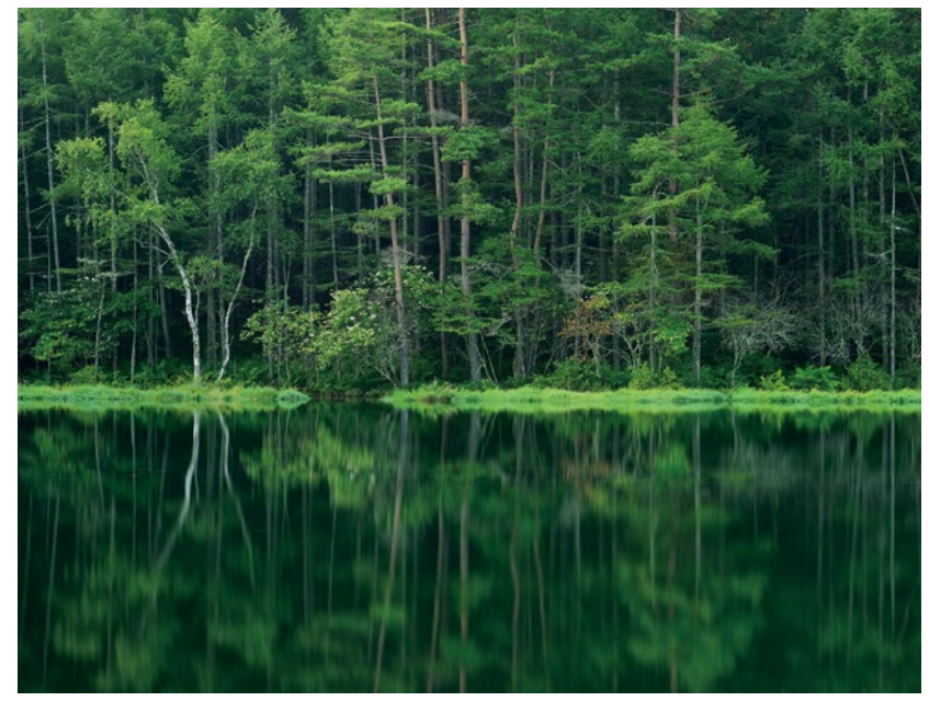
Mishaka Pond is spectacular in all seasons. The shining surface of the pond reflects the stunning natural surroundings: the night sky, fall colors, ice-slicked winter, and lush greenery of spring and summer.