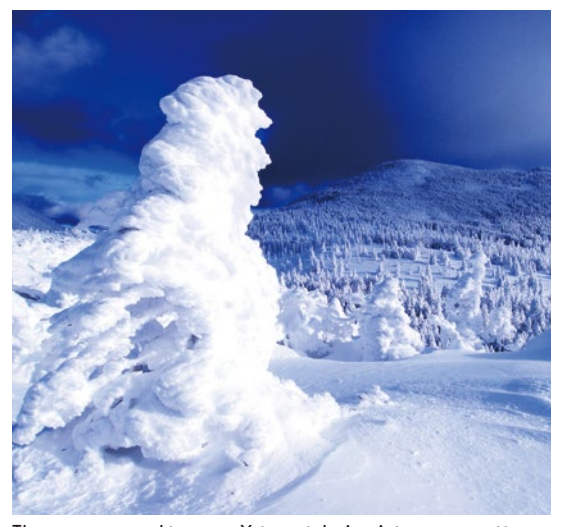
The snow-covered trees on Yatsugatake in winter are a pretty sight, but higher up the slopes where there is greater snowfall, they take on a more mysterious look — and earn themselves the eerie epithet of Tateshina Snow Monsters.