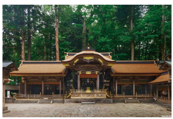
Suwa Taisha is one of the oldest shrines in existence, dating back more than a millennium. The deity, who is revered by locals, presides over wind, water, agriculture, and hunting.