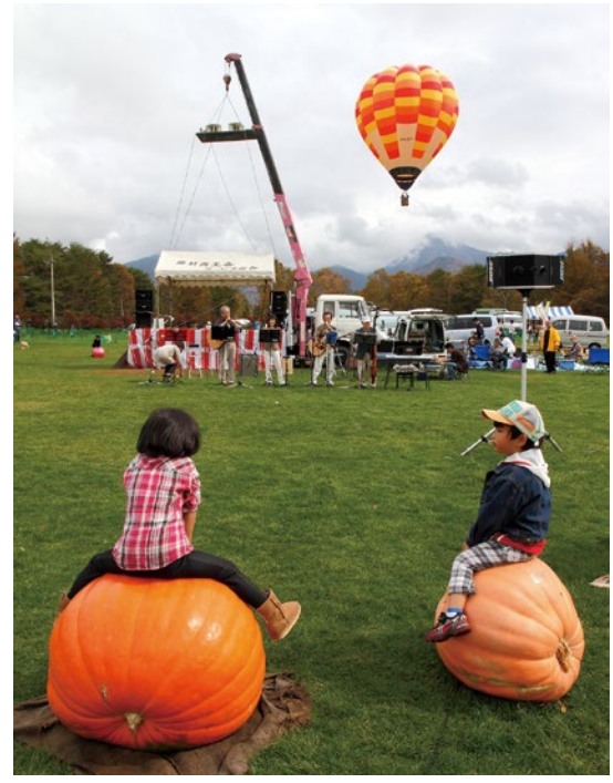
In October, Hara Village holds its Harvest Festival. Against a fetching pastoral background, guests enjoy locally made products such as handmade butter and croquettes. They also carve pumpkins, play games, and watch alpenhorn performances.