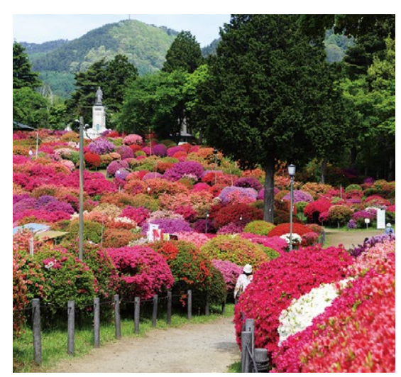
The azaleas (tsutsuji) that bloom in spring in Okaya Tsurumine Park blanket the hills in a riot of color, attracting flower enthusiasts from afar.