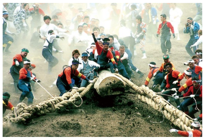
The traditional Onbashira Festival is held only every six years. In spring, massive fir trees from the forest are felled and then, with brave young men astride, are pushed down the slope at terrifying speeds.