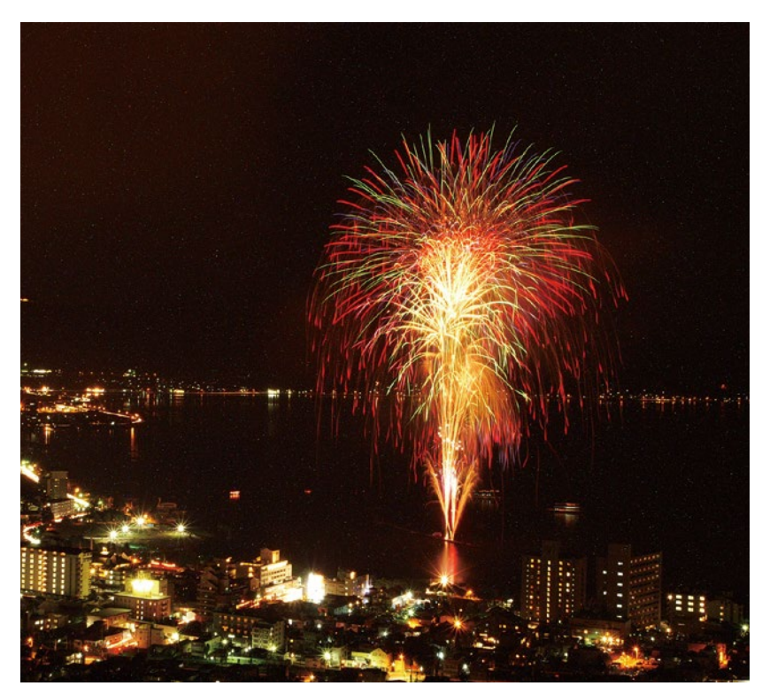
During summer, Suwa City puts on magical fireworks displays over Lake Suwa. Lights reflect off the water and fire flowers bloom over the lake. Some 800 fireworks are set off every day in August, with the grandest display, featuring 40,000 fireworks, held on the 15th.