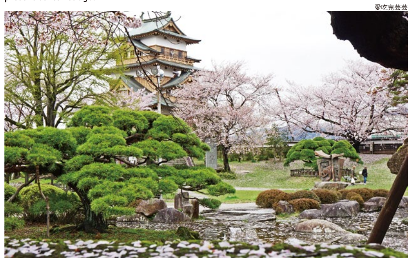
Built in 1598, Takashima Castle stands near the banks of Lake Suwa. It is surrounded by a moat and gardens, and has commanding views of surrounding areas from its keep. It is also a splendid place to view cherry and wisteria blossoms.